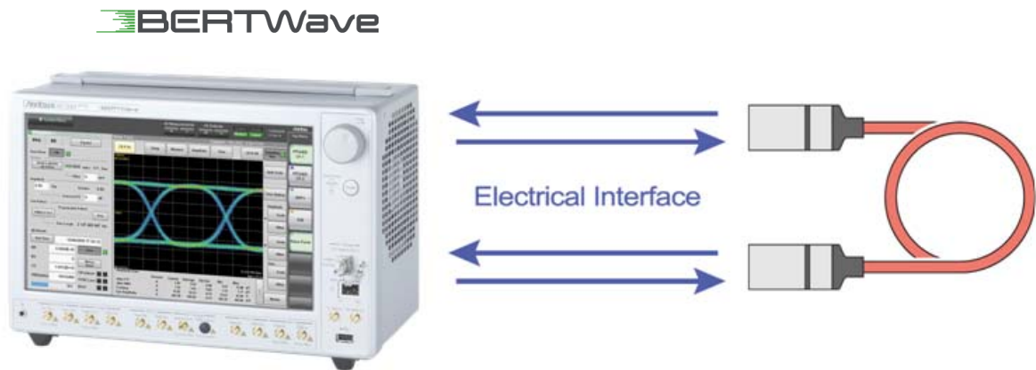
Active Optical Cable Evaluation